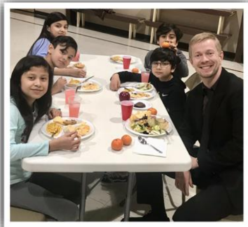
Left: Wednesday evening services with a meal.