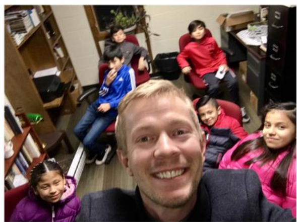
Left: Some of the coolest kiddos in Siouxland... my catechism students. Since this picture was taken, I have 5 new kids and 3 adults that I study the Bible stories and catechism with every week.

That's it for now! May our Lord bless you and keep you! Thank you for your continued prayers and financial support of our Siouxland Hispanic Ministry!