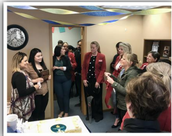
Right: Working with other community non-profits to advocate for our immigrant neighbors.